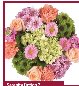
Serenity Option 2