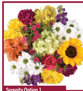
Serenity Option 1