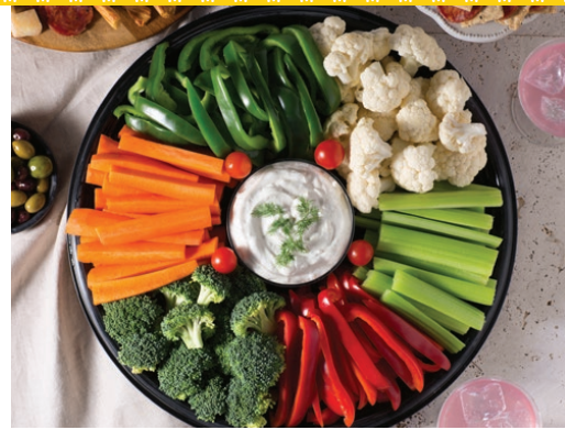
← Vegetable Tray Enjoy this assortment of fresh, crisp vegetables, cut into snack-size pieces and accompanied by our own special dip. D08-A • serves 8-12 1870 cal • $25.99 D08-B • serves 12-18 2160 cal • $35.99 D08-C • serves 18-25 2300 cal • $45.99