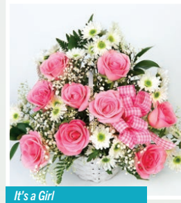
It's a Girl