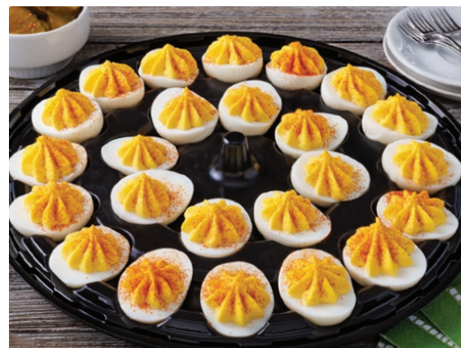
← Deviled Egg Tray Add these old fashioned favorites to your buffet table and watch them disappear. And you thought deviled eggs were just for picnics! D06-A • serves 3-5 (12 halves) 1140 cal • $12.99 D06-B • serves 6-10 (24 halves) 2400 cal • $19.99