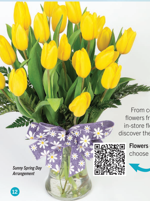
Sunny Spring Day Arrangement