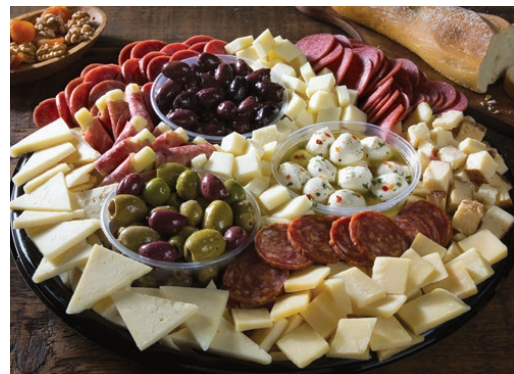
← Mediterranean Tray A traditional Mediterranean selection consisting of specialty meats, cheeses and olives, with savory flavors ranging from mild to complex. This tray is sure to impress all. D07 • serves 22-28 9900 cal • $69.99