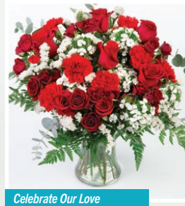
Celebrate Our Love