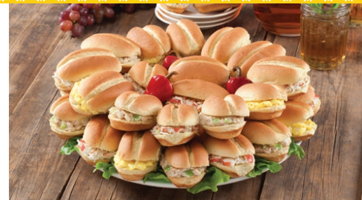
Finger Sandwich Tray ↑ This tray includes 32 delicious finger rolls filled with an assortment of chicken salad, seafood salad, tuna salad, or egg salad. Select one variety or try all four. D14 • serves 10-15 • 6400 cal • $36.99