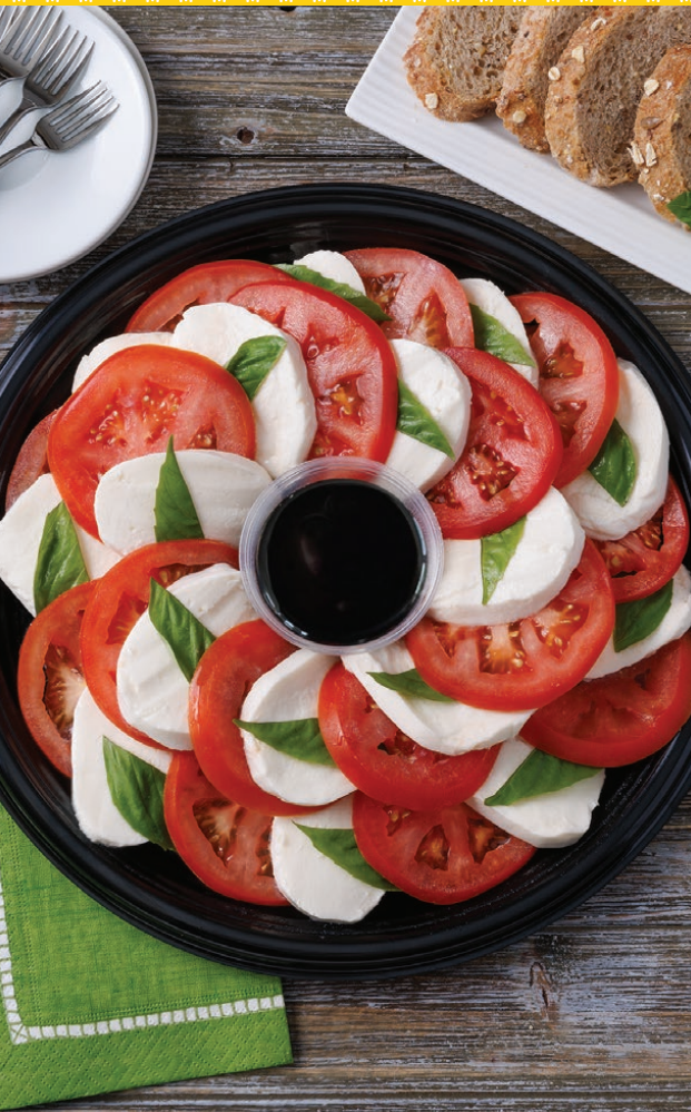
Tomato and Mozzarella Tray ↑ A refreshing salad! Made with fresh sliced beefsteak tomatoes, layered with fresh mozzarella and basil. Includes a balsamic glaze for drizzle. D05 • serves 4-6 • 1560 cal • $19.99

We have everything you need to complement our fresh deli party platters... from the season's freshest vegetables and tastiest condiments to a wide selection of fresh salads.