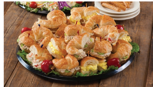
Croissant Sandwich Platter Choose one or all of our freshly made delicious chicken, tuna, egg, or seafood salads. All served on our fresh baked, light and fluffy buttery croissants. D15 • serves 12-14 • 5880 cal • $39.99 (12 croissants cut in half) ↓