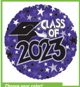
Choose your color!