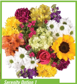
Serenity Option 1