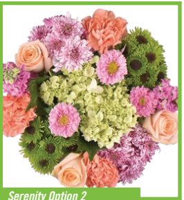
Serenity Option 2